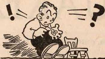
COUNTING YOUR PENNIES AS YOUR ALLOWANCE NEARS ITS END-