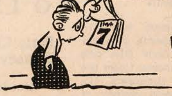
COUNTING THE DAYS TO VACATION-