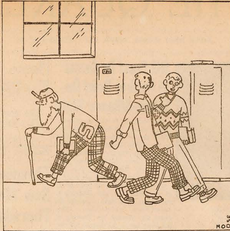
Him? Oh, he's a returned war veteran..... Civil War.

The team will need your support more than ever tonight . . . So make sure you are at the game to back them up. See you then. . . .