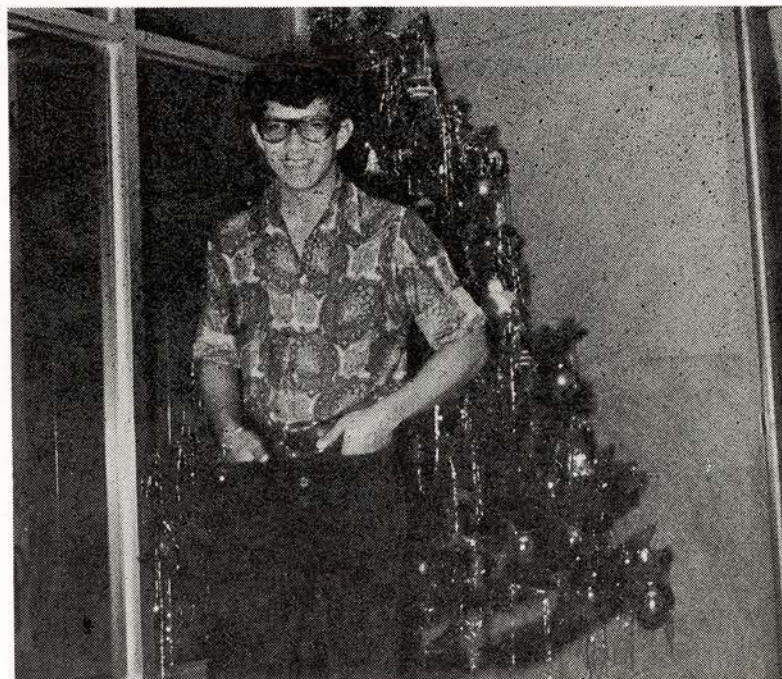
Salem's visitor from Colombia, South America

The levy is actually not enough to do all that the school board would like to do with the budget, but it certainly would have helped. State funding ran out after 1969. Salem just waited too long to bring this before the voters. With a state tax passed, the building levy last year, and rising inflationary costs, voters just don't want to choose to spend more of their money no matter how worthy the cause.