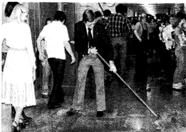
Most classes went on normally during the period of the water leakage problem.