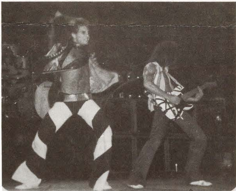
David Lee Roth and Edward Van Halen in Pittsburgh.