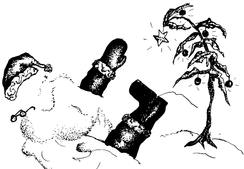
Even Santa has his ups and his downs!

Here is a list of upcoming concerts for the months of December and January. Dec. 20 Rick Springfield, Front Row Dec. 29, Allmon Brothers, Pittsburgh Civic Arena. Dec. 31, Michael Stanley Band, Richfield Coliseum. Jan. 1, Michael Stanley Band, Richfield Coliseum. Jan. 26, Rod Stewart, Pittsburgh Civic Arena.