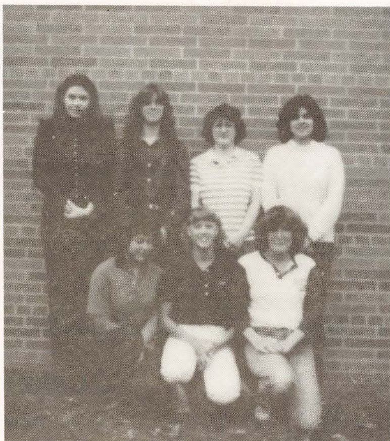
Pictured above are seven of the Girls' Staters.