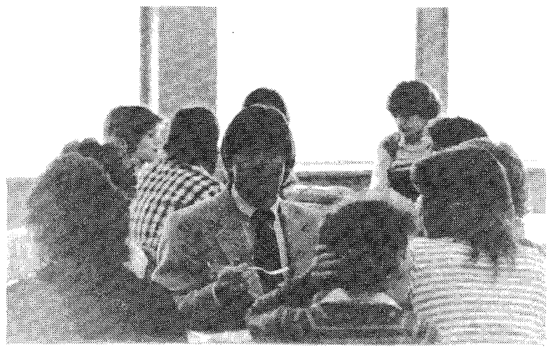
Visiting his Alma Mater.

This evening the 1984 MORP will be held in the cafeteria from 10-12 P.M. This event is co-sponsored by the Student Council and Interact. Planned activities for the dance, which presents the theme "Jailhoue Rock," will be the crowning of king and queen and the unprofessional taking of portraits. The king will be selected by voting upon entering the dance; this procedure will also be used to select his court. The court will consist of a freshman, sophomore and junior boy and their escorts no matter what their status. Reigning over this court will be the top senior vote getter as king and his escort as queen. Hope to see you there.