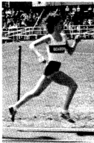
Track Stars In Action