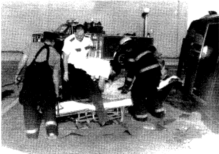
Firemen and Paramedics rescue a YSU student from a wrecked car in the circle at the gym entrance of the high school.

After 37 hours of "Ward, the Beaver burned down the Dairy Queen again," and "Well dear, I'll have a talk with him," you'll do anything to make it stop.