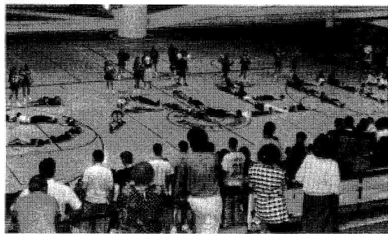
"Give me an S-A-L-E-M!" Pep club members spellout "Salem" during an all sports pep rally held earlier this year.

As for my own opinion, I hope it will last for the simple reason that we will have someplace to go. I also think it'll turn out the way we make it. We can just sit around and complain about the people who go there or the fact that they don't have anything for me, or we could have positive attitudes and go there. If there is somebody we don't like there, just ignore the fact they are there and have a good time.