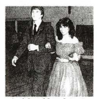
A girl and her date at a 1980's prom

About ten years ago, in the early 1990's, more subtle hues were being worn. Makeup was