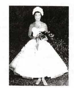
1950's prom style

you're up on your fashion news, then it's apparent that he is probably the most famous shoe designer of this century. His popularity skyrocketed in the 1970's when the stiletto heels came back in style for prom. The stiletto heel was originally from the 1950's, along with more conservative colors and fabrics for both guys and girls.