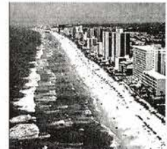
Panama City Beach, Florida

No matter the season, everyone's style will be unique to their own personality, which is the great thing about fashion. Just feel comfortable in whatever you choose to wear this summer, and you will heat up the scene.