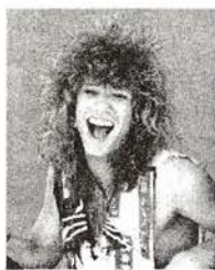
this band; Bon Jovi.

Which band went from being blue-collar Jersey boys playing small local bars and proms to become the world's biggest rock band? Which band had every one of their eight albums go platinum and has charted ten top-ten hits (eight of them from 1986 to 1989) and is still producing hits today? Jon Bon Jovi, Richie Sambora, Tico Torres and David Bryan are the members of this band; Bon Jovi. Born John Francis Bongiovi, Jr. on March 2, 1962, Jon Bon Jovi grew up in Sayerville, New Jersey, just 30 miles south of New York City. Not having anything much else to do in the small town Jon took up a huge interest in music in his free time. Growing up with inspiration from other New Jersey rockers such as Bruce Springsteen, Little Steven and Southside Johnny, Jon decided to form his own band, The Atlantic City Expressway, in 1979. One of the first people to audition for the band was a keyboard player named David Bryan. The Expressway was a moderate success with the Jersey locals, but it was Jon who commanded the spotlight.