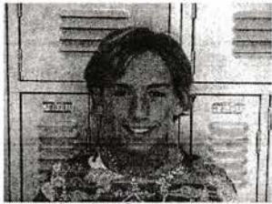
Brooke Banning Track