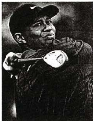
Tiger tees off at the 9th during the Masters.