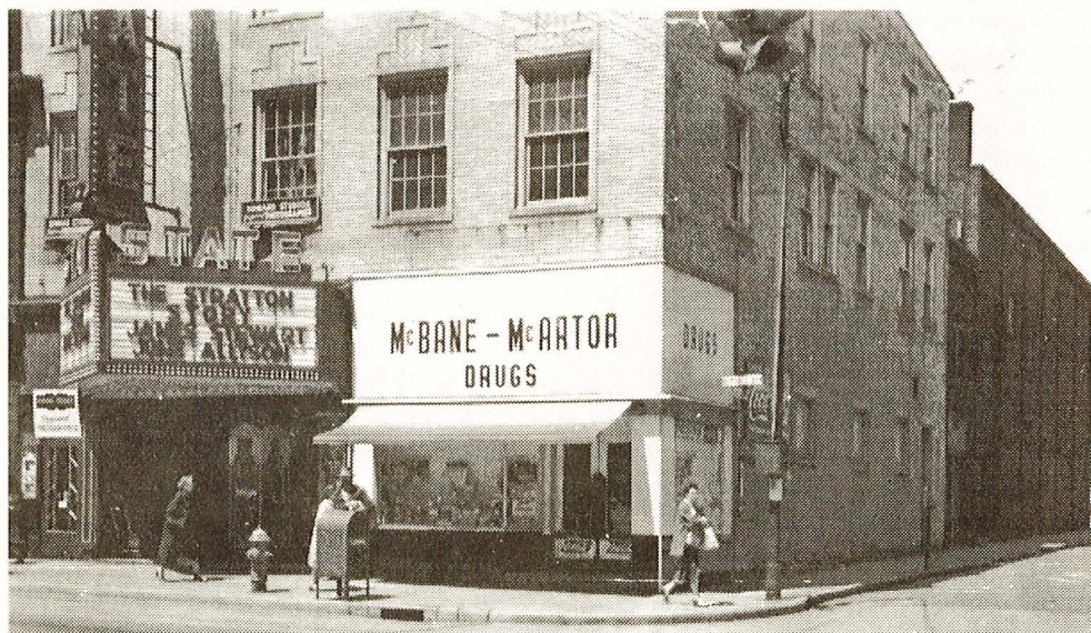
McBane - McArtor Drugs, Lundy and State, circa 1940's