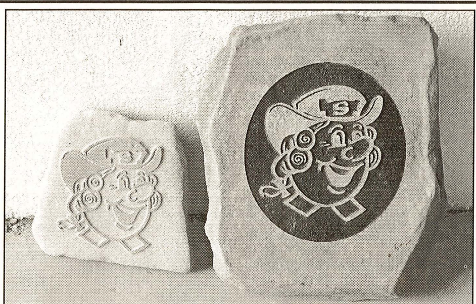
Patio stones with the Quaker Sam image, above, are available from the alumni association for a $40 donation. The stones, provided by the Logue Monument Co. in Salem, vary from 12 inches to 2 feet. For more details, contact the alumni office at 877-332-1427.

We've been informed that the 1947 Salem High School basketball team, at the 1950 squad, lost the second tournament game to Warren.